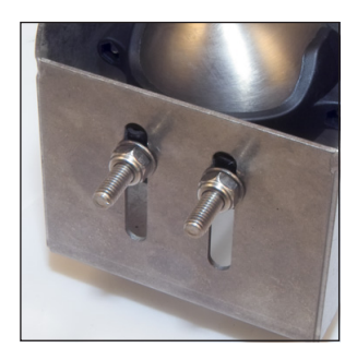
Slotting holes for positioning camera in vertical and horizontal direction.